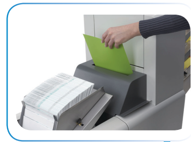
Daily Mail Feeder

* Paper & envelope specifications may vary. All media must be tested.