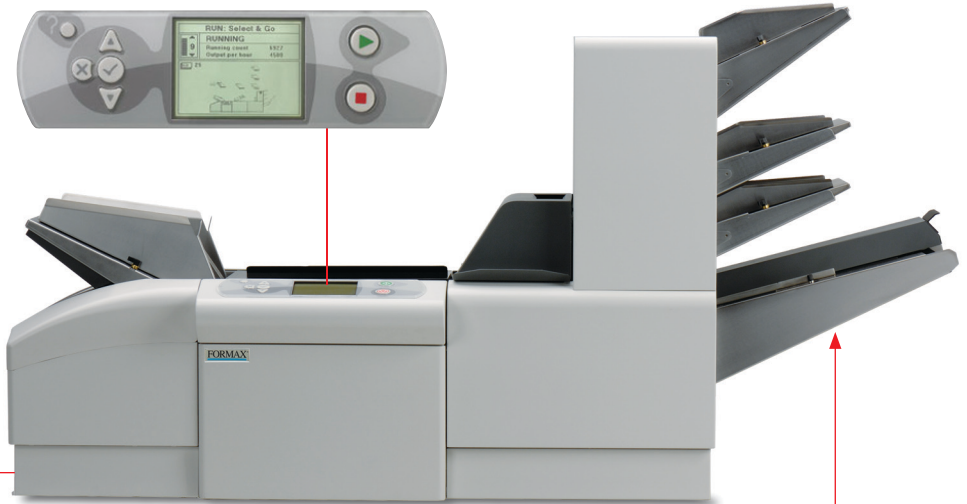
FD 7100-Basic 3 w/ Optional Accumulator