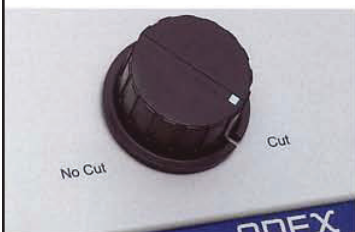
Cut/No Cut Knob