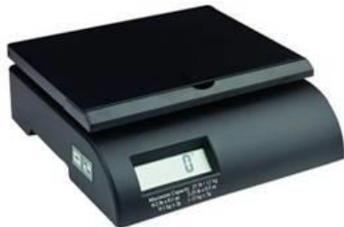
Optional 25lb scale