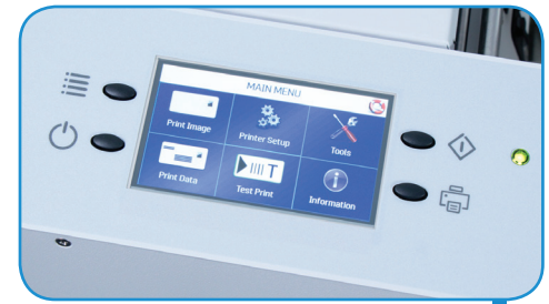
User-friendly color touchscreen