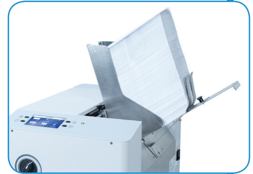
Integrated feeder holds up to 500 envelopes