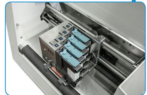
4-pen stitched single-head design