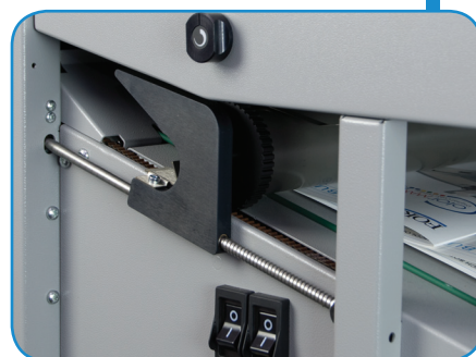
Automatic outfeed rollers