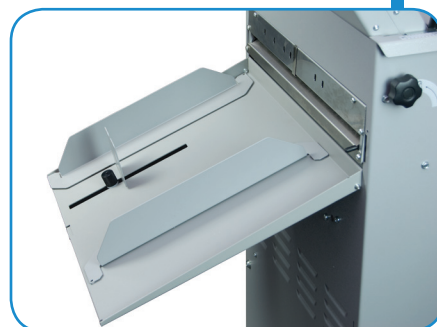
Perforation / score attachment, included