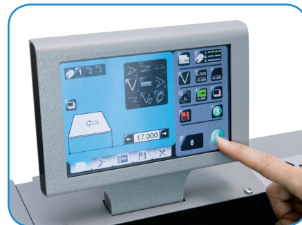
Color touchscreen control panel

* Speed varies depending on paper weight