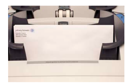
Envelope feeder 60 envelope capacity also lets you load material on the fly for continuous operation.