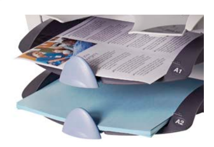
Sheet feeders Load up to 80 sheets. A sheet feeder is included. A second sheet feeder is an available option.