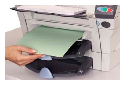
Convenience feeder Give everyday mail a professional look by feeding up to 3-pages stapled or unstapled.