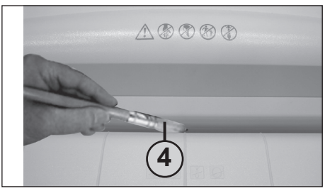
Figure 4 Cleaning the Photocells

To remove these paper strips and also to clean the photocell, pass another sheet of paper through the feed slot, or switch the machine to reverse and wipe both "eyes" of the photocell with a brush.