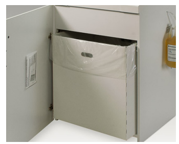
Figure 3 Receptacle

NOTE: The machine turns off automatically if it is not used after 10 minutes.