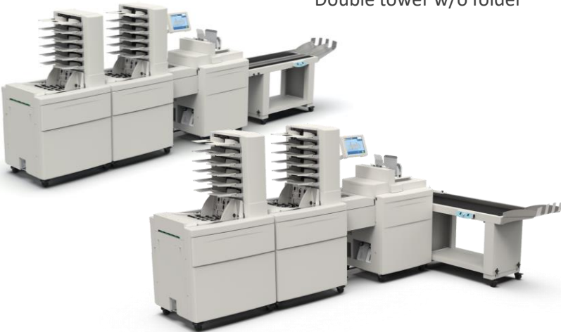
Double tower w/o folder