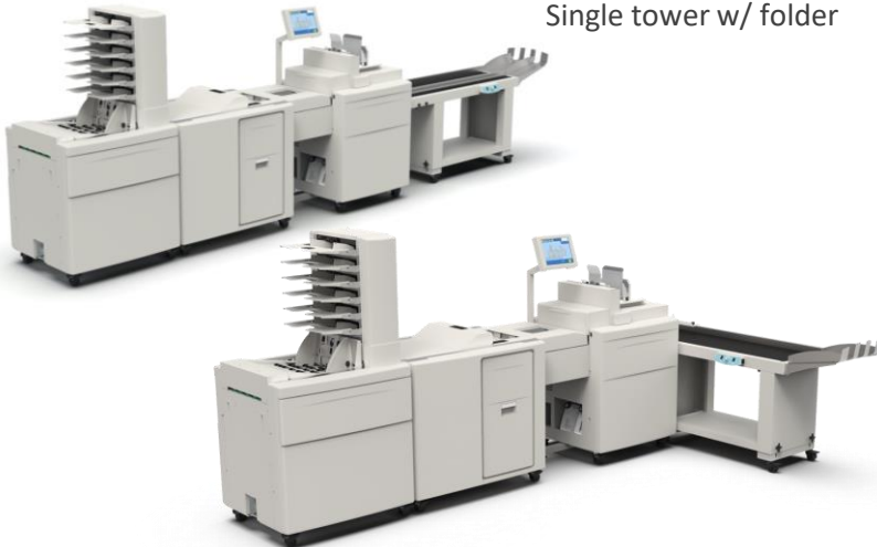
Single tower w/ folder