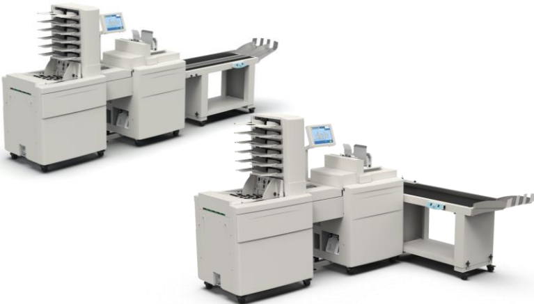
Single tower w/o folder